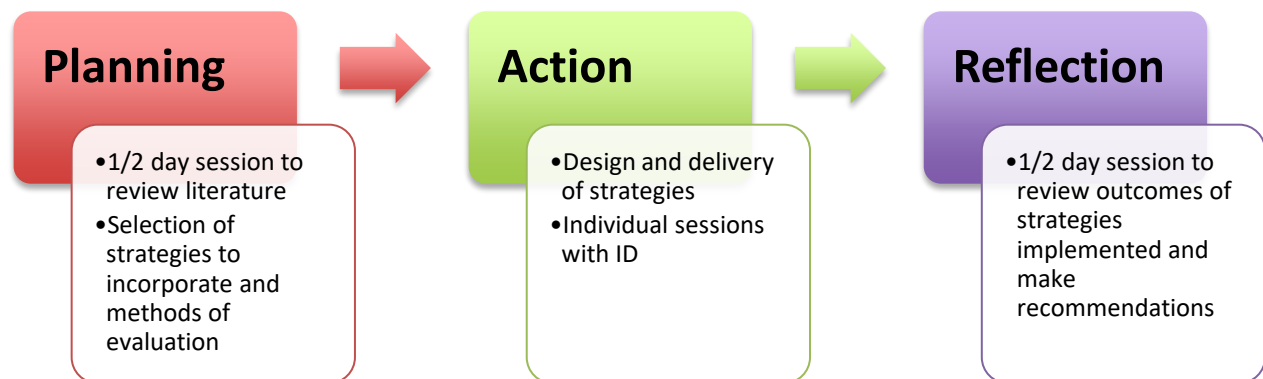
Figure 2. Phases of participatory action research methods.

The action research method used three phases and included participants in all phases. Following the researchers’ beliefs that educators, as practitioners, are key stakeholders and therefore must be included and represented in all phases of the action research, “dialogue” was implemented as part of the action research, adhering to “the values of teamwork, sound relationships, assessment, respect, safety, immediacy, engagement and accountability” (Moseley, 2004, p. 112). Through the action research phases (Figure 2), participants were asked to make suggestions on effective pedagogy and processes to be included in a planned handbook resource for educators.